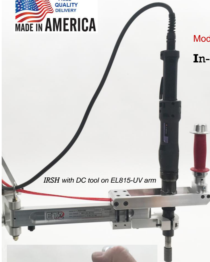
IRSH with DC tool on EL815-UV arm