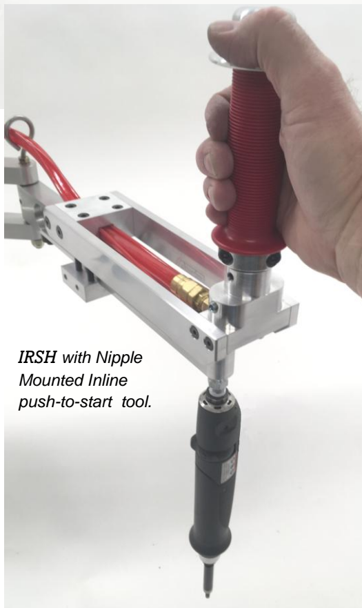
IRSH with Nipple Mounted Inline push-to-start tool.